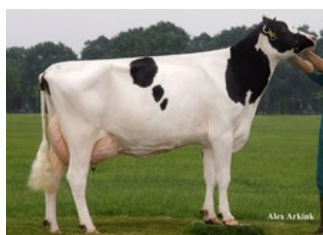
Broeks MBM Elsa EX-90