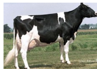
Ever-Green-View Elsie EX-92