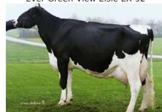
Ever-Green-View Le Grant EX-90

VG-88 Renegade x VG-87 Sound System x VG-87 Franchise x GP-84 McCutchen x VG-85 O Man x EX-90 BW Marshall x VG-89 Aaron x EX-92 Bell Elton x EX-90 Grant-Twin x EX-91 Winken