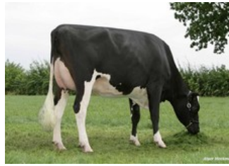
Excellence Mac Melissa VG-87