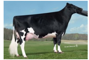
Glenn-Ann Shottle Pepper EX-90