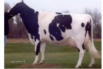
Glenn-Ann Miss Pepperdine VG-89

VG-87 Snowman x VG-87 Mac x EX-90 Shottle x EX-90 Durham x VG-89 Rudolph x VG-87 Formation x VG-85 Blackstar x VG-87 Chief Mark