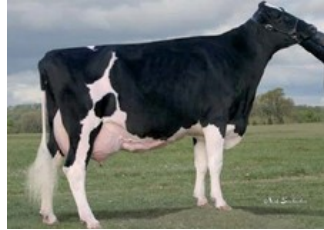
Glenn-Ann Durham Pepper EX-90