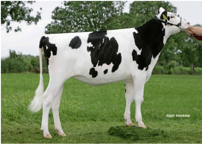
Bacchus Pepper 7 VG-87