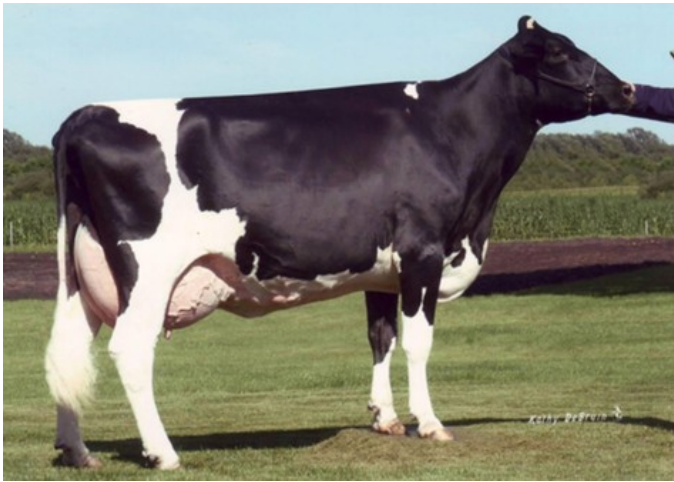
Scientific Beauty Rae EX-90