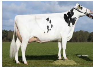
Zandenburg Snowman Ebony 1 EX-90