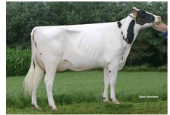
Zandenburg Twist. Ebony EX-90