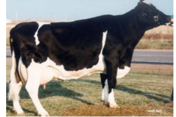
Rocky-Vu Mars Esthe Extasy VG-87

AltaTop-Red x VG-86 Jacuzzi-Red x VG-88 Finder x Boss x EX-90 Snowman x EX-90 Twister x VG-86 Goldwyn x VG-86 Lancelot x VG-87 Webster x VG-89 Lucky Leo