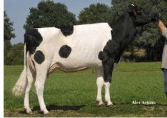
Zandenburg Goldwyn Ebony VG-86