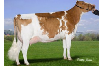
Misty Springs MB Brighter Red VG-87

VG-86 Global x GP-83 Hotspot P x VG-87 Hologram-P x GP-83 Chipper-P x GP-84 Bookem x VG-86 Man-O-Man x VG-87 Mr Burns RC x VG-88 September Storm x VG-88 Talent x VG-87 Dragon RDC