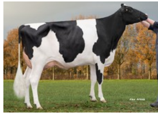
K&L OH Mabel