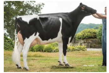
Maybelline Tual VG-85