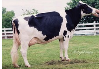
Mayerlane-DK Hiawatha EX-90