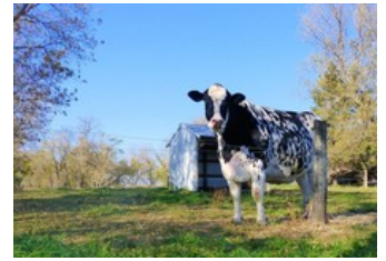
Larcrest Cosmopolitan VG-87