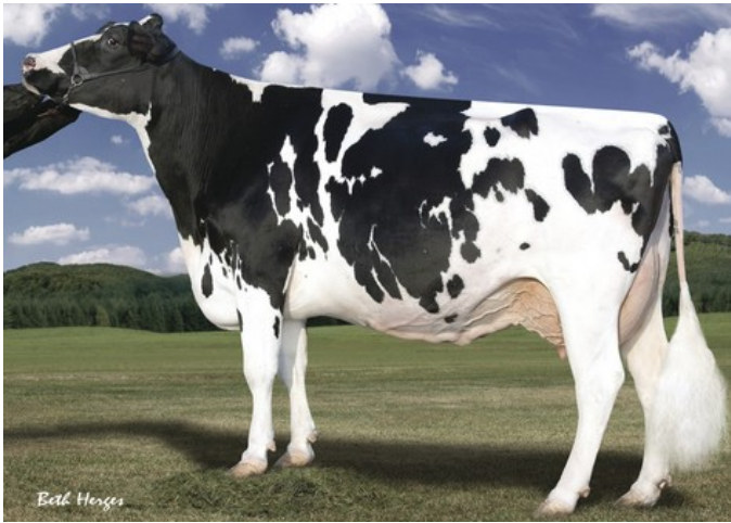
Larcrest Outside Champagne EX-90