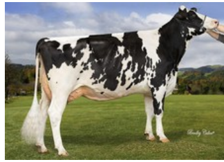
COL Carmen VG-86, Headliner x