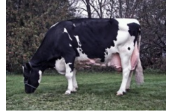
Larcrest Juror Chanel EX-93

VG-85 Simon P x GP-83 Hotspot P x Bandares x GP-83 Damaris x VG-88 Shotglass x VG-88 Freddie x VG-87 Shottle x EX-90 Outside x EX-93 Ked Juror x VG-85 Lindy