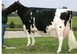
Larcrest Juror Chanel EX-93