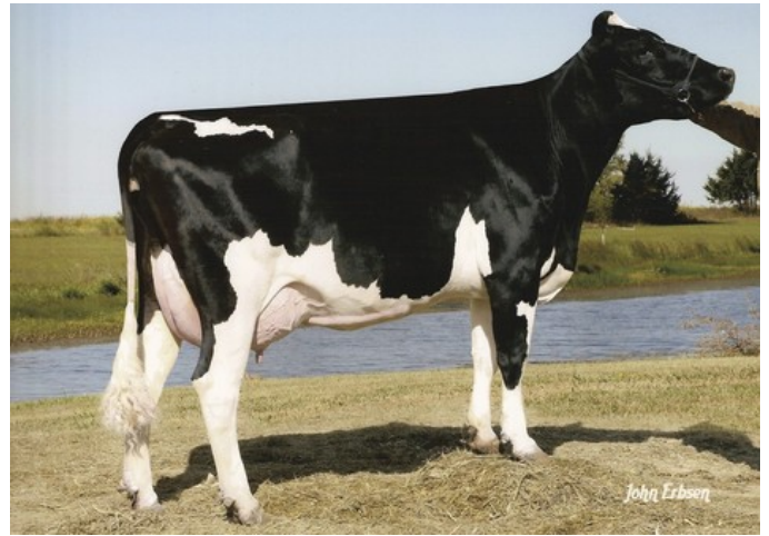
De-Su Oman 6125 GP-82

VG-85 Einstein x VG-86 Redrock x VG-86 Modesty x GP-84 Supershot x VG-85 Maurice x G-76 Shamrock x EX-92 Shottle x GP-82 O Man x EX-90 BW Marshall x EX-90 Patron