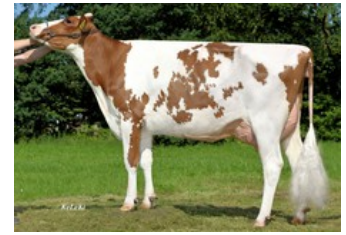
MAR Belami P Red GP-83