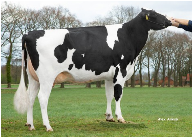
Basic PP RDC GP-83