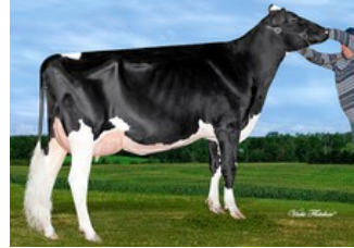
Misty Springs MOM Brenna RDC VG-