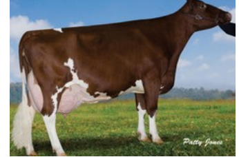
Aldonhill Milestone Brilliance VG-88

GP-84 Best Benz x GP-83 Hotspot P x VG-87 Hologram-P x GP-83 Chipper-P x GP-84 Bookem x VG-86 Man-O-Man x VG-87 Mr Burns RC x VG-88 September Storm x VG-88 Talent x VG-87 Dragon RDC