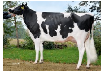
Brigitta PP RDC VG-87