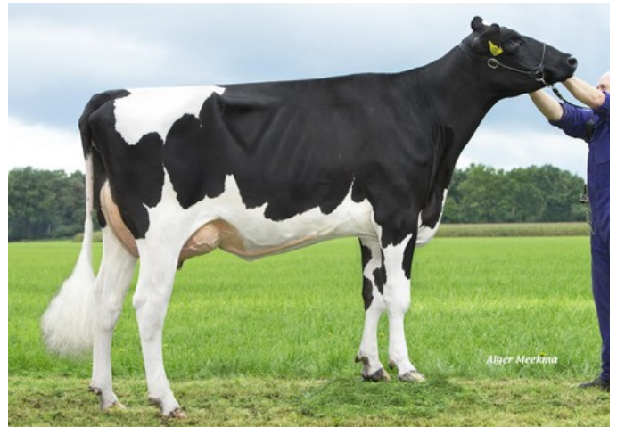
Diepenhoek Rozelle 65 VG-87

VG-85 Einstein x VG-89 Kenobi x VG-85 Rubi-Agronaut x Superman x VG-87 Mogul x VG-86 Sandy x VG-87 Shottle x VG-87 Jesther x VG-89 Ronald x EX-91 Southwind