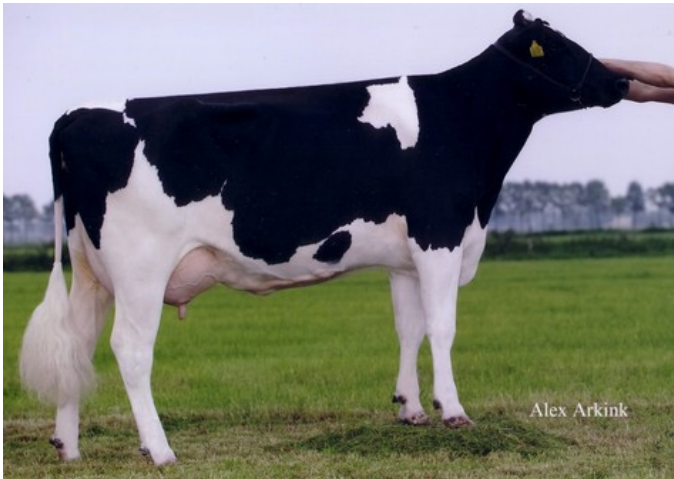
Diepenhoek Rozelle 4 VG-87