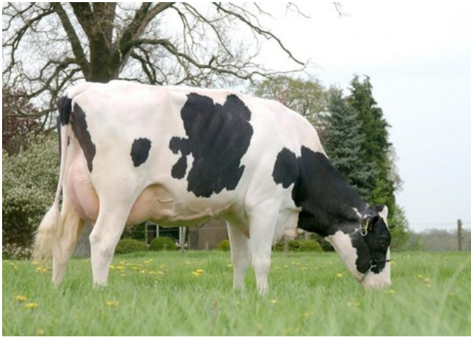
Holbra Petra EX-90