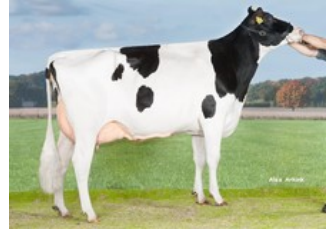
Holbra Sandian VG-88