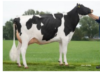
Holbra Joy 1 VG-88