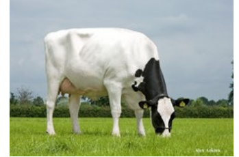
Holbra Sana VG-89

VG-87 AltaZarek x VG-88 Casper x VG-87 Jedi x VG-86 Kingboy x VG-88 Meridian x VG-89 Snowman x VG-85 Bolton x VG-87 O Man x EX-90 Morty x VG-88 Durham