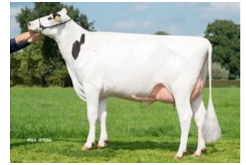
Holbra Sandoya VG-86