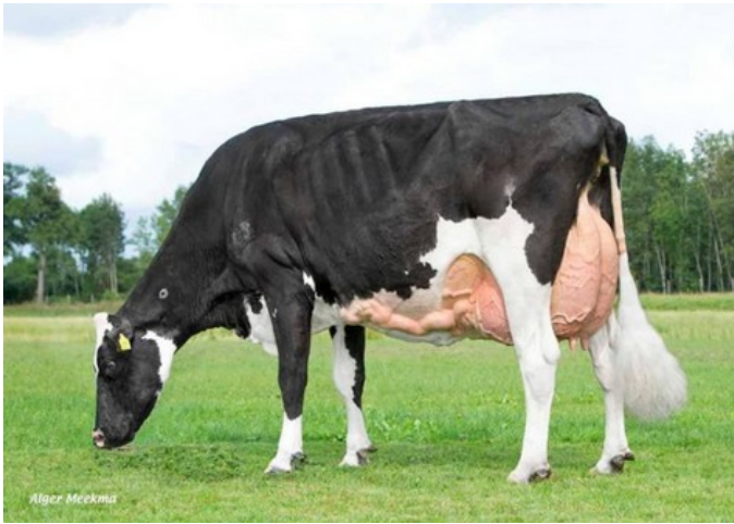
New Moore Esmeralda 38 EX-93