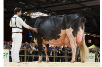
New Moore Esmeralda 38 HHH 2019

EX-93 O Man x VG-88 Goldwyn x GP-83 Hole in One x VG-85 Rudolph x Hardtac x VG-86 Cleitus x VG-88 Bell x EX-94 Astronaut x EX-91 Elevation