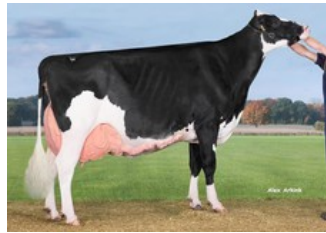
New Moore Esmeralda 38 2017 EX-93