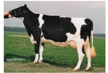
Delta Esmeralda VG-86