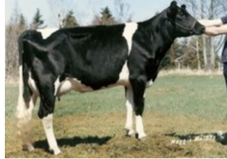
Walkup Bell Lou Etta VG-88