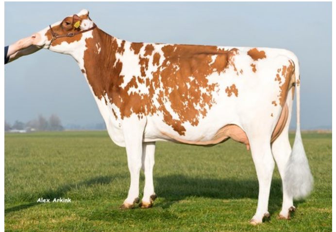
Batouwe Salsa Aiko Red VG-85

VG-87 AltaTop-Red x Alaska Red x VG-85 Salsa RC x VG-87 Supersire x VG-85 Alexander x EX-91 Goldwyn x EX-95 Durham x EX-93 Prelude x EX-94 Jubilant RF x EX-96 Marquis King