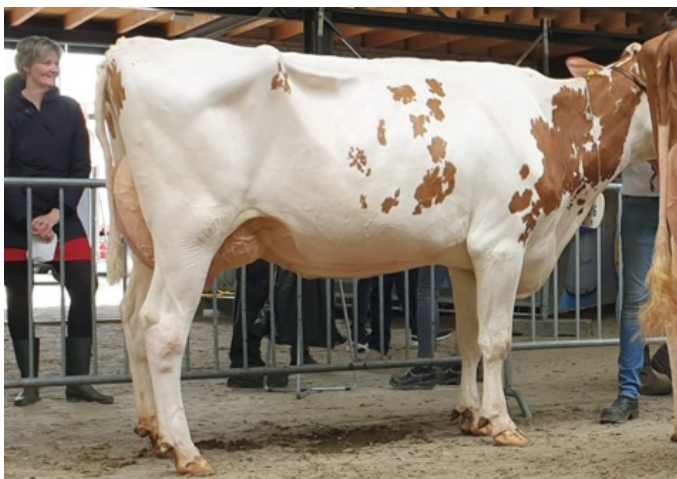
R&B Altatop Ailene Red VG-87