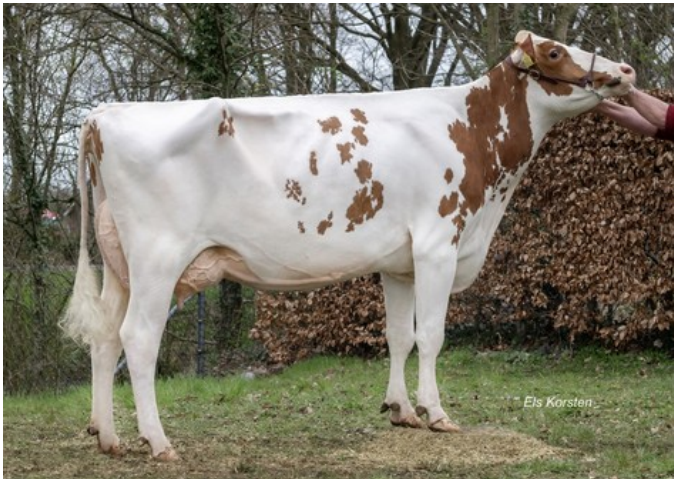
R&B Altatop Ailene Red VG-87