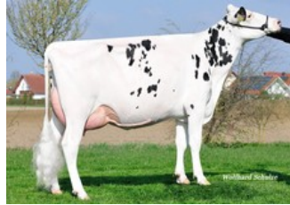
SPH Gallerie VG-86