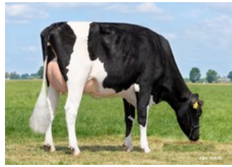
K&L Poppe Gonda VG-86