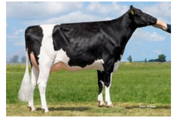
K&L Poppe Gonda VG-86