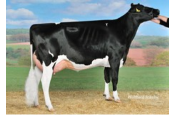
Tirsvad Beacon Galaxy VG-85

G-79 Gigabyte x VG-86 Rubi-Agronaut x GP-84 Cinema x VG-86 Shotglass x VG-85 Beacon x VG-88 Juwel x VG-86 O Man x VG-87 Aaron x EX-91 Esquimau x VG-89 Lucky Leo