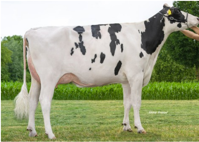
Sietskeshoeve 3STAR Gaby G-79