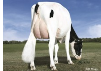
Des-Y-Gen Planet Silk EX-90