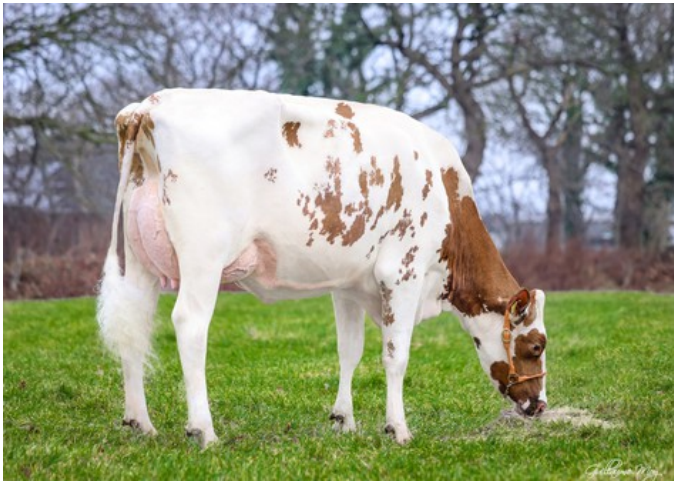
GLH Ronald Aura Red VG-86