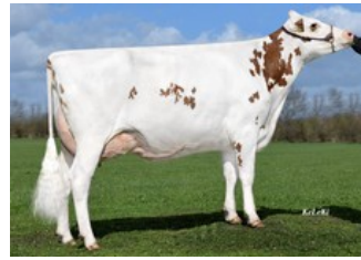
Schreur Vision Red VG-88