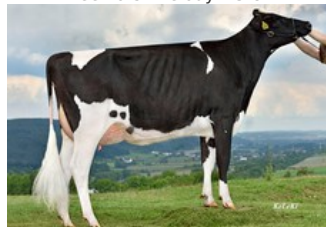
Vekis Sudan Mellow VG-88