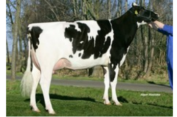
Vekis Xaco Melody VG-87

VG-85 Vh Crown x VG-87 Gymnast x Shep x VG-86 Balisto x VG-88 Sudan x VG-87 Xacobeo x VG-85 Goldwyn x VG-85 O Man x VG-87 Durham x GP-83 Fred