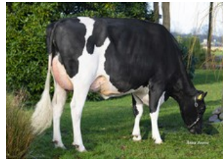
Veelhorst Melody VG-87