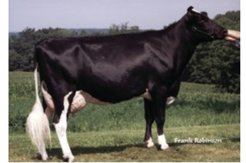
Tolare Rudolph Cupid, zus v Jimtown

VG-87 Einstein x Granite x VG-85 Rubicon x GP-84 Cashcoin x VG-86 Man-O-Man x VG-86 Shottle x GP-84 Finley x Brett x Lantz x VG-85 Jimtown