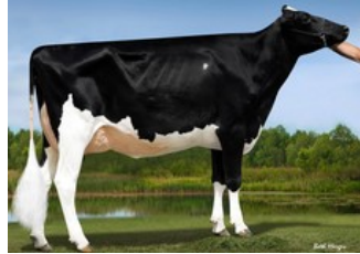
MS Ariannas Door Armani VG-85