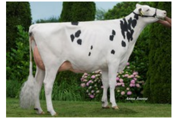
HC Archrival Arianne 1st lac. VG-89