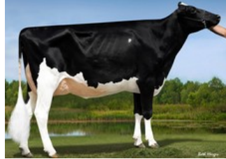
MS Ariannas Door Armani VG-85