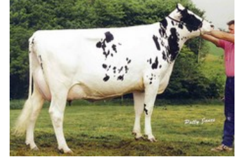
Glen Drummond Shower EX

Simon P x VG-87 Apo Red PP x VG-85 Silver x GP-83 Earnhardt P x GP-82 Colt P x VG-85 Socrates x VG-87 Goldwyn x VG-87 Durham x VG-86 Formation x VG-88 Aerostar