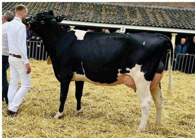
Caudumer Ebony 24 RDC VG-89

VG-89 Jacuzzi-Red x VG-88 Finder x Boss x EX-90 Snowman x EX-90 Twister x VG-86 Goldwyn x VG-86 Lancelot x VG-87 Webster x VG-89 Lucky Leo x VG-86 Bellwood