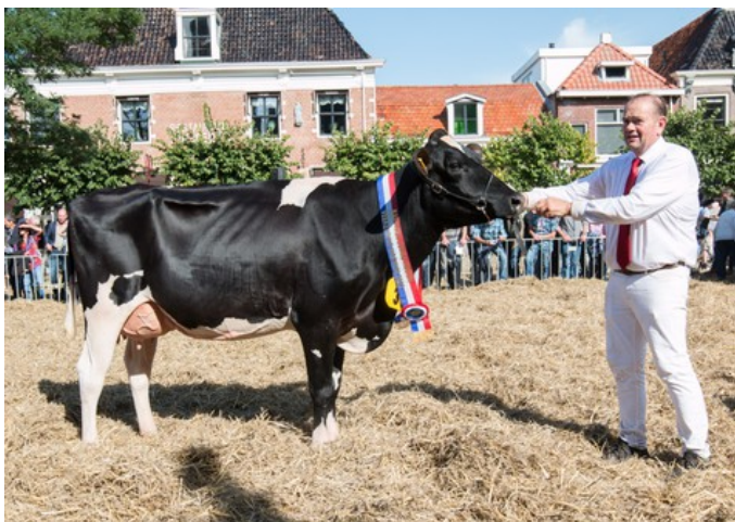
Caudumer Ebony 24 RDC VG-89