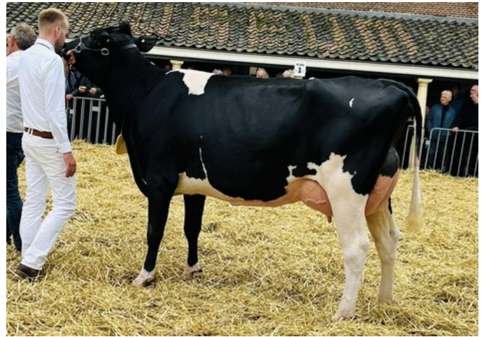
Caudumer Ebony 24 RDC VG-89

VG-89 Jacuzzi-Red x VG-88 FINDER x Boss x EX-90 Snowman x EX-90 Twister x VG-86 Goldwyn x VG-86 Lancelot x VG-87 Webster x VG-89 Lucky Leo x VG-86 Bellwood