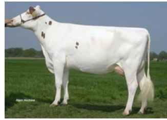
Delta Sterre GP-83