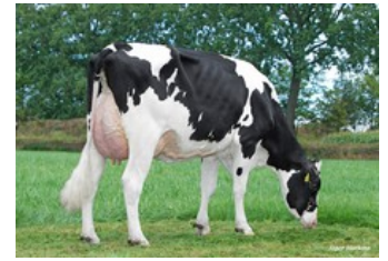
Manders Suze VG-88