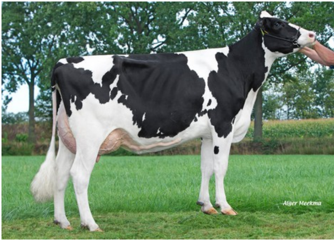
Manders Suze VG-88