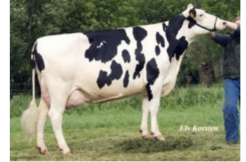
Stoeetje 2 VG-86

VG-86 Ranger x VG-88 Esperanto x VG-86 Atlantic x VG-85 Frank-P x VG-87 Fidelity x GP-83 Spencer x VG-86 O Man x VG-85 Lentini