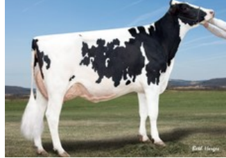
Gold-N-Oaks Arabell 1765 VG-88,