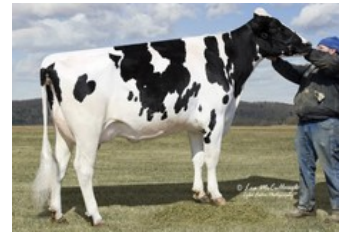
Gold-N-Oaks S Marbella VG-89