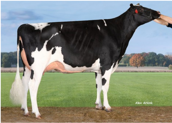
Pen-Col Superhero Mistral EX-91