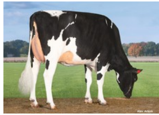
Pen-Col Superhero Mistral EX-91