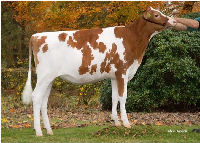
3STAR Oh Aileen Red VG-86