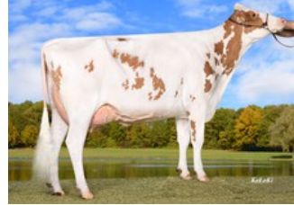
Wilder K25 Red EX-90