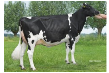
Wilder Kalibra RDC VG-88