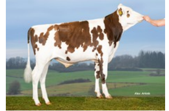
3STAR OH Ragnar Red

Solitaire P Red x VG-87 Styx Red x VG-88 Battlecry x EX-90 Brekem RDC x VG-88 Snowman x VG-89 Shottle x VG-88 Ramos x GP-84 Danube-Red