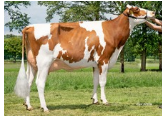
Kalibra SX 5631 Red VG-87