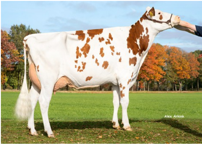
De Oosterhof K&L Kalibra 1 P Red