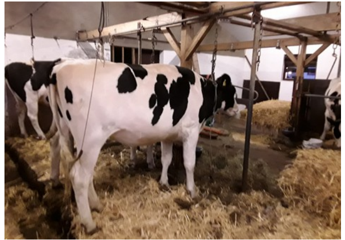
PR Shauny VG-88

Doc x VG-88 Modesty x GP-83 McCutchen x VG-87 Man-O-Man x EX-92 Planet x VG-86 Shottle x VG-86 O Man x EX-92 Rudolph x EX-90 Bell Elton x VG-87 Mandingo