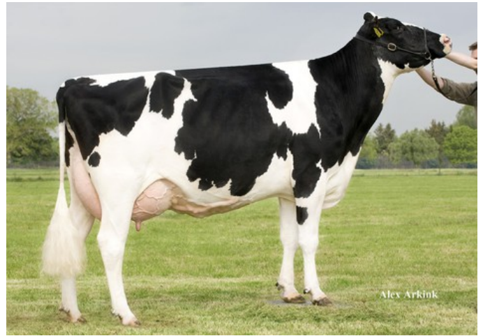
Holbra Mascol Pam VG-87

VG-86 Bellwether x VG-86 Concert x VG-85 Background x VG-86 Suran x VG-86 Gerard x VG-87 Mascol x VG-88 Durham x EX-90 Rudolph x EX-95 Chief Mark x EX-91 Sexation