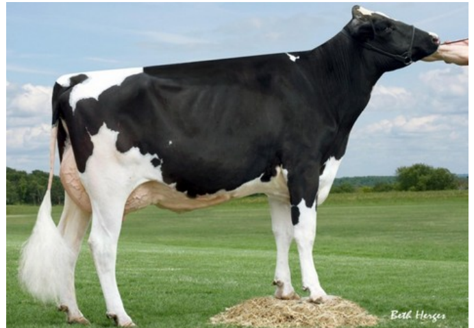
Larcrest Chenile VG-86

VG-86 Kenobi x VG-86 Sound System x VG-87 Balisto x VG-87 Beacon x VG-86 Ramos x EX-90 Outside x EX-93 Ked Juror x VG-85 Lindy x VG-87 Inspiration