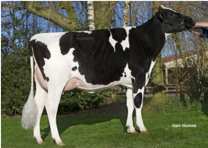
Roccafarm Beacon Chrissy VG-87