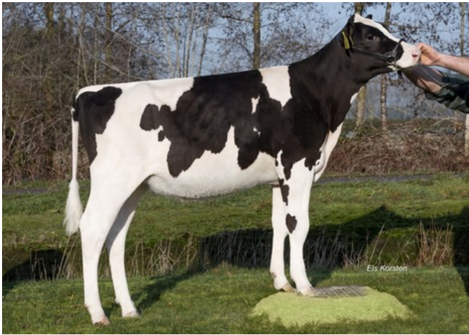
HET Gywer Chayenne RDC ET VG-85