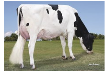
Plain-Knoll Mogul Mariah VG-88