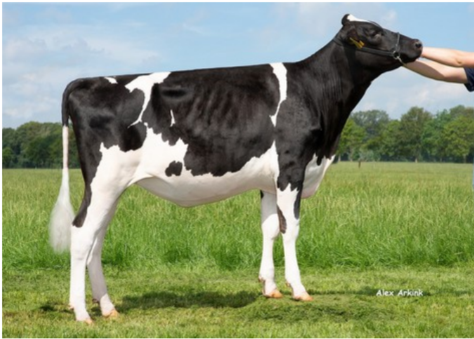
De Oosterhof K&L Miracle VG-85