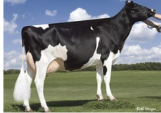
Roylane Socra Mira 1760 EX-91