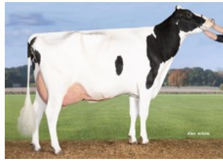
K&L OH Mirror GP-82