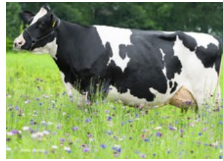
De Oosterhof Dg Rose RDC VG-89