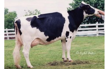
Mayerlane-DK Hiawatha EX-90

GP-84 Swingman Red x VG-89 Rubicon x GP-83 Aikman RDC x VG-85 Man-O-Man x VG-87 Mascos x VG-88 Durham x EX-90 Rudolph x EX-95 Chief Mark x EX-91 Sexation x EX-93 Elevation