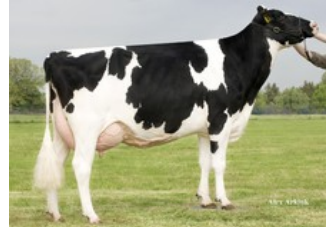
Holbra Mascos Pam VG-87