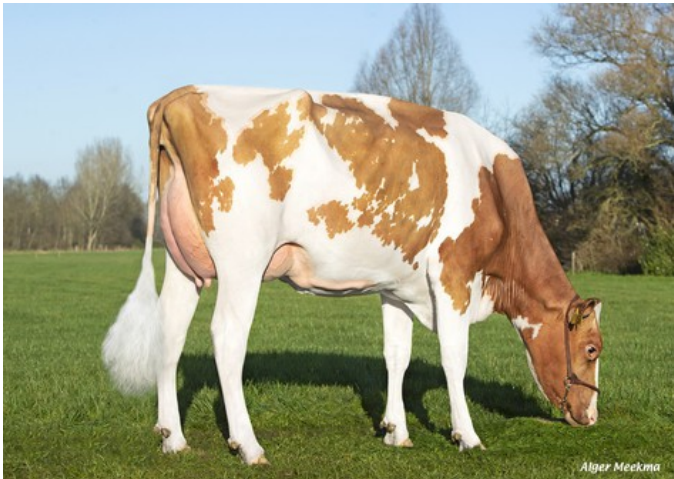
Quatropoint K&L SW Rosita Red GP-84