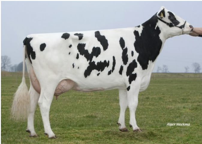
Veneriete Shottle Ida 6 VG-88