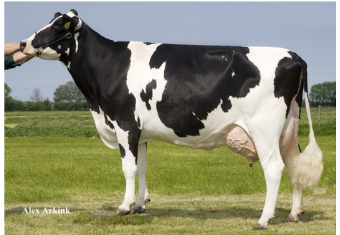
Butemare Veneriete Ida O VG-86

GP-84 Fanatic x VG-88 Shottle x VG-86 O Man x VG-87 Ronald x VG-85 Jabot x VG-85 Curioius x VG-86 Southwind