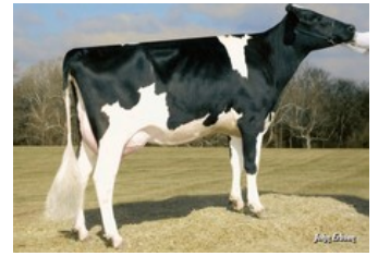
Pine-Tree Martha Sheen VG-86