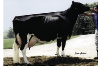
Wesswood-HC Rudy Missy EX-92

GP-83 Pharo x VG-88 Modesty x GP-83 McCutchen x VG-87 Man-O-Man x EX-92 Planet x VG-86 Shottle x VG-86 O Man x EX-92 Rudolph x EX-90 Bell Elton x VG-87 Mandingo