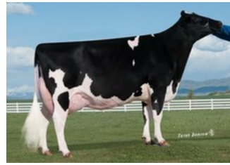
Ammon-Peachey Shauna EX-92