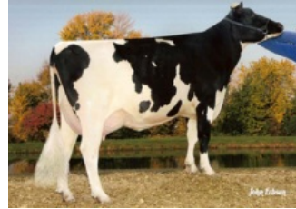
Pine-Tree Missy Miranda VG-86