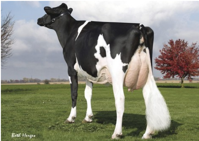
Ammon-Peachey Shauna EX-92