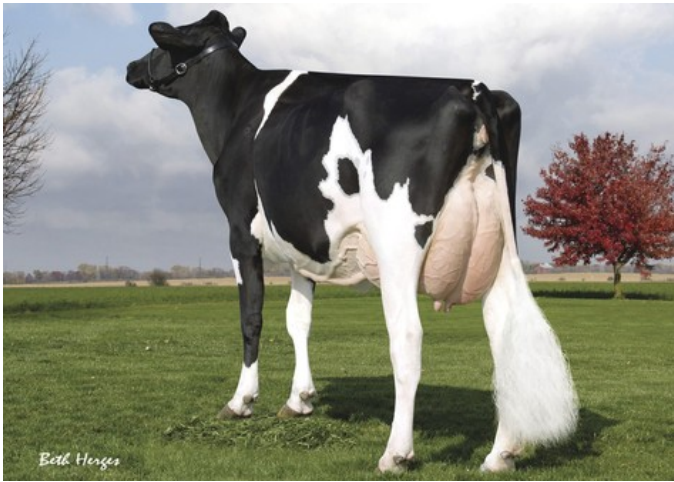
Ammon-Peachey Shauna EX-92