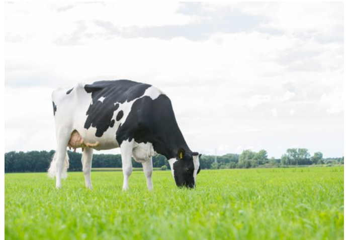
KHE I'm Good VG-88

Durable x VG-88 Gymnast x VG-87 Rubicon x VG-89 Shotglass x VG-88 Windbrook x VG-88 Jeeves x VG-85 Goldwyn x VG-85 Juror Ford x VG-85 Cleo x VG-89 Aerostar