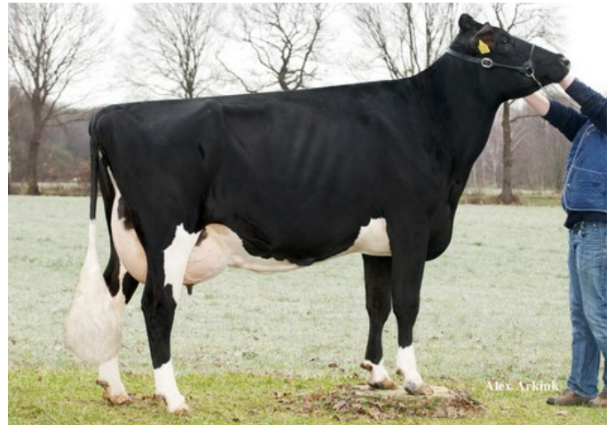
Apina Massia 102 RDC EX-90

Aikman RDC x VG-85 Colt P x VG-86 Kylian x EX-90 Shottle x EX-90 Lentini x VG-85 Tulip x VG-86 Andries x VG-85 Jubilant RF