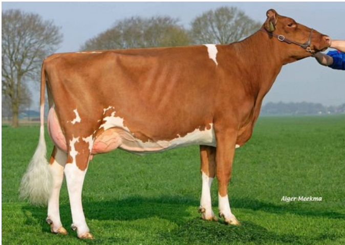
FG Massia 106 VG-86