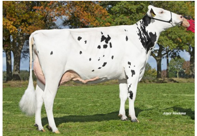
HET Sound Chenile VG-86

VG-87 Soundcloud x VG-86 Sound System x VG-87 Balisto x VG-87 Beacon x VG-86 Ramos x EX-90 Outside x EX-93 Ked Juror x VG-85 Lindy x VG-87 Inspiration