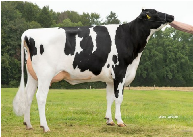
HET SC Charlene VG-87