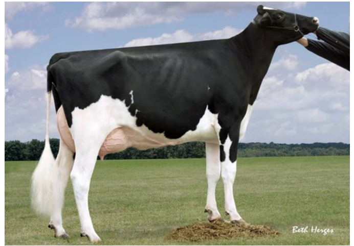
Nova-TMJ Golden Erin-ET EX-90

VG-85 Yoda x VG-87 Silver x VG-88 Shotglass x EX-90 Altalota x EX-90 Goldwyn x VG-87 Roy x EX-90 Mark Sam x EX-90 Patron x VG-87 Southwind x VG-85 Jax