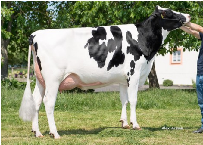
HES Emi (v. Silver) VG-87