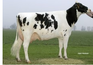
Koepon Shot Classy 17 VG-85