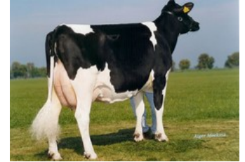
Koepon Classy VG-86

VG-86 Kenobi x VG-87 Superhero x Silver x GP-83 AltaOak x VG-85 Man-O-Man x VG-85 Shottle x VG-86 Simon x VG-86 Merrill x VG-88 Bell Elton x VG-87 Rotate