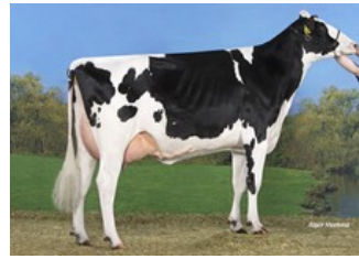
Koepon Mano Classy 90 VG-85