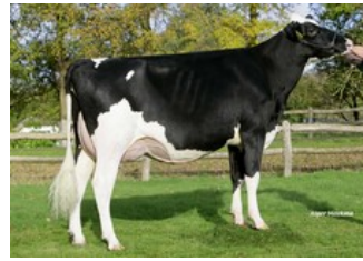
Bouw Goli Flower VG-87