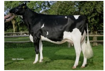
Bouw Goldwyn Femmy EX-90