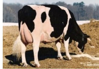
Ralma Durham Frisky VG-88