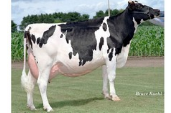
Ralma Juror Faith EX-91

Jacuzzi-Red x VG-89 Balisto x VG-87 Goli x EX-90 Goldwyn x VG-86 Shottle x VG-88 Durham x EX-91 Ked Juror x VG-89 Leadman x Melwood x VG-88 Chief Mark