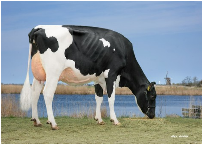
Rhala Excellent Flower VG-89