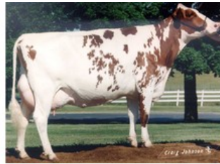
S-F-L Enhancer Scarlette-Red VG-89