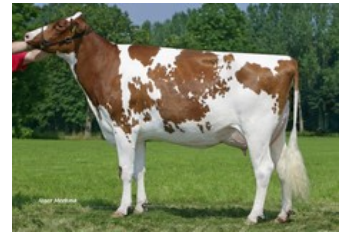
Verhages Bos Candlelight P Red VG-86