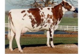
Stookey Fgn Scarlet-Red EX-94

VG-85 Jacuzzi-Red x VG-85 Jetset x Eraser P x VG-86 Lawn Boy P-Red x VG-87 Shottle x VG-87 Marmax x VG-86 Patron x VG-87 Aerostar x VG-89 Enhancer x EX-94 Fagin