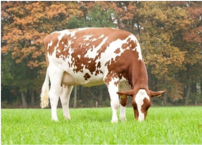
Candlelight P Red graas VG-86