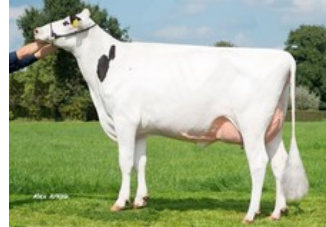
Holbra Sandoya VG-86