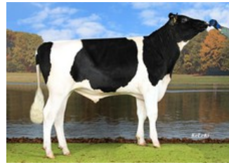
Holbra Escape SG-ET