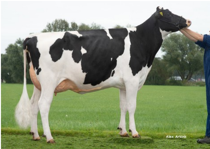
Holbra Joy 1 VG-88