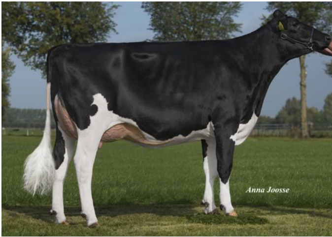
Willems-Hoeve Rita 1626 A VG-86