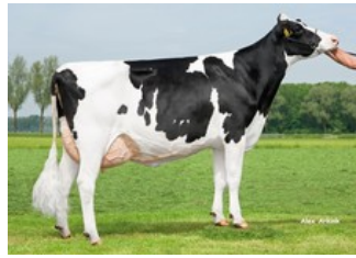
Willem's Hoeve Rita 885 VG-85