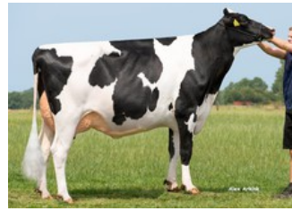
Holbra Malon 9 VG-88