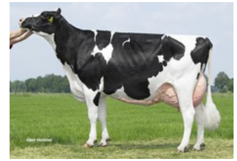
Holbra Malon 3 VG-88