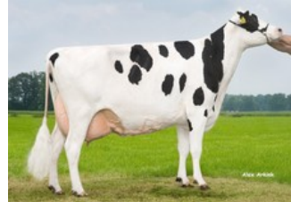
Holbra Malon VG-87