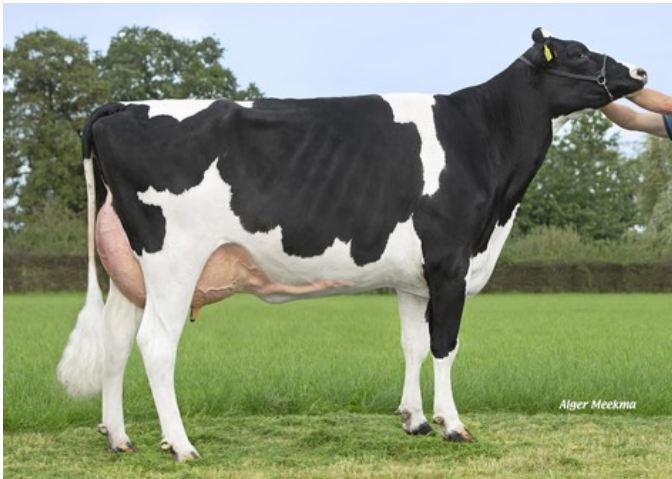
Holbra Malon 17 VG-87