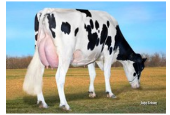
S-S-I BOOKEM-MODESTO VG-87