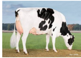
JK Eder Darling 2 EX-90