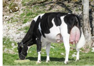
Full sister 3rd dam: DH Gold Chip