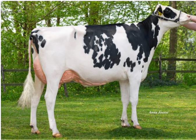
De Belhoeve Darling VG-89