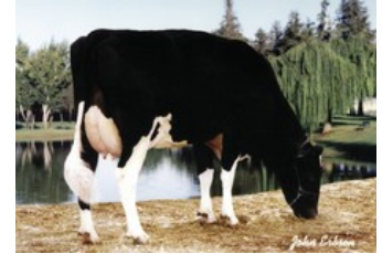
Regancrest Elton Dream VG-86

VG-89 Defiant RDC x VG-87 Doorman x EX-90 Gold Chip x VG-89 Mr Sam x VG-88 BW Marshall x VG-87 Jolt x VG-86 Bell Elton x EX-95 Chief Mark x EX-90 Bell