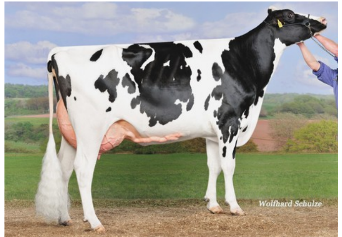
RR Eluisa VG-89

VG-85 Cameron x Battlecry x VG-86 Boss x VG-89 Maxim x EX-90 Shottle x EX-90 BW Marshall x VG-89 Aaron x EX-92 Bell Elton x EX-90 Grant-Twin x EX-91 Winken