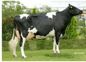
Willem's Hoeve Rita 233A EX-92