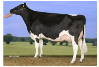
Willem's Hoeve Rita 331 VG-89