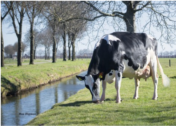
Willem's Hoeve Rita 9863 EX-92