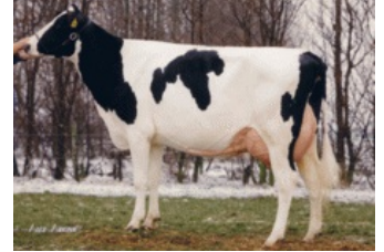
Willem's Hoeve Rita 52 EX-93

EX-92 Danillo x VG-89 Ramos x VG-87 Shottle x EX-92 Lord Lily x EX-93 Sunny Boy x EX-93 F16