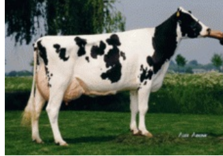
Willem's Hoeve Rita 221 EX-93