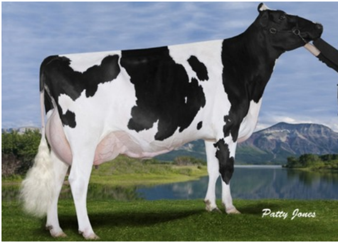
Gen-I-Beq Goldwyn Secret RC VG-87