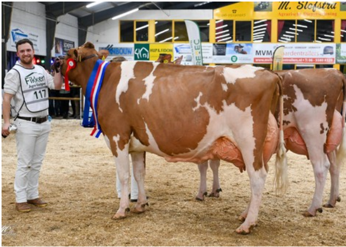
NRP Awesome Amberlee Red EX-90