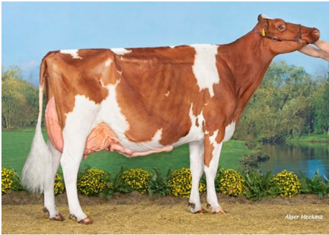
NRP Awesome Amberlee Red EX-91